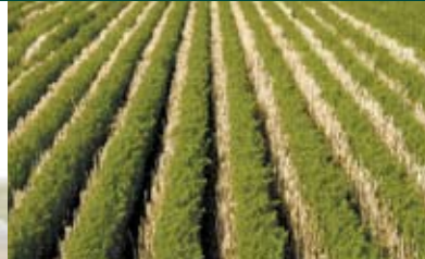
Seed Between Stubble Rows