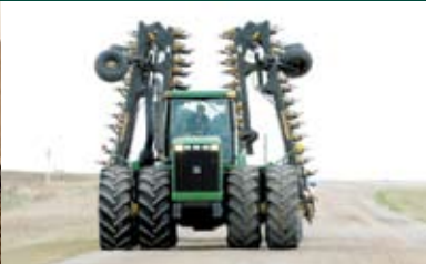
CT-Design 18' Transport Width