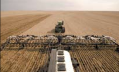
90' Air Drill