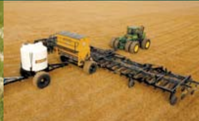
77' Air Drill, 14" Row Spacing Sulky Liquid Cart